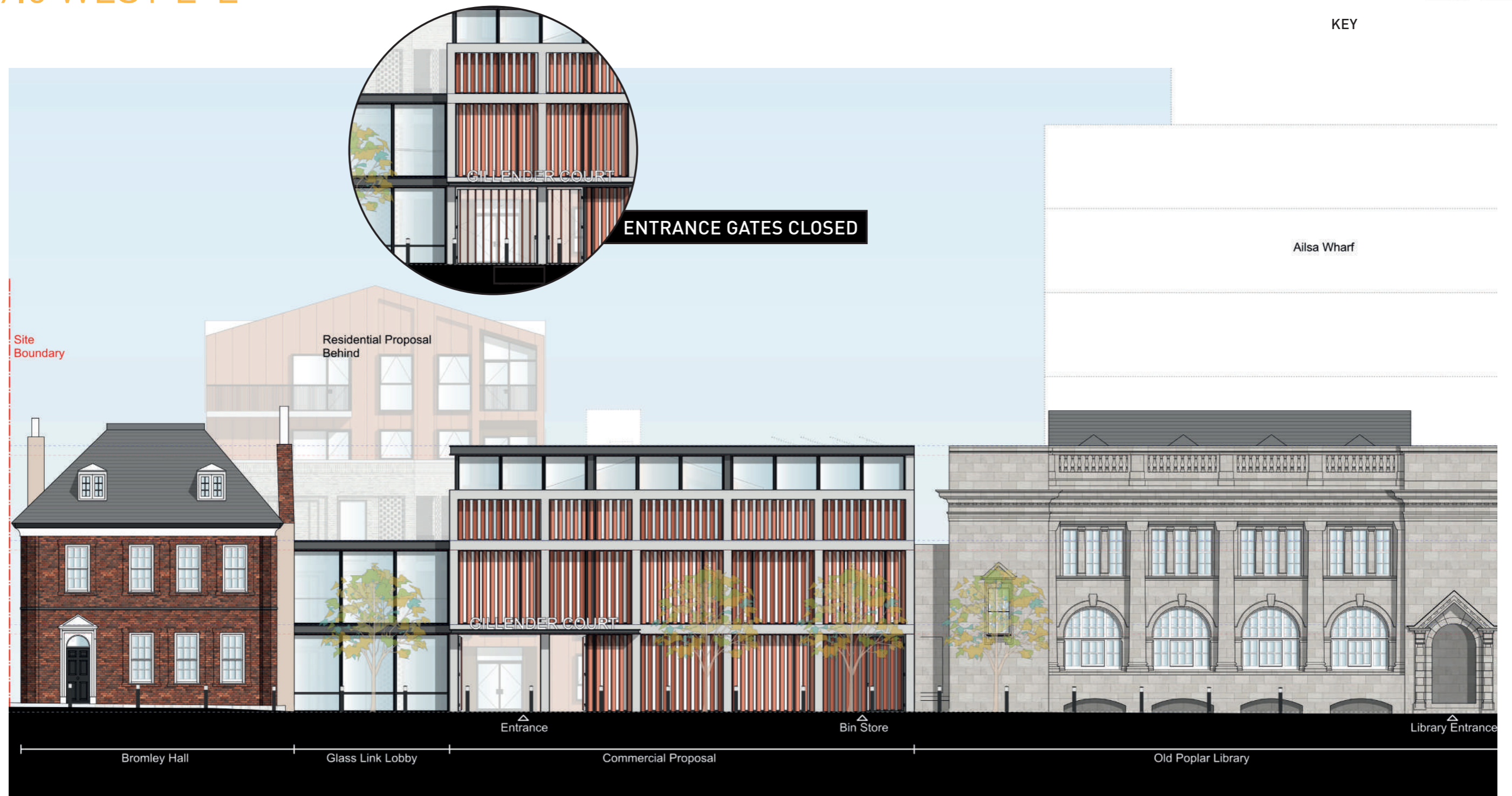
WEST ELEVATION (E-E)