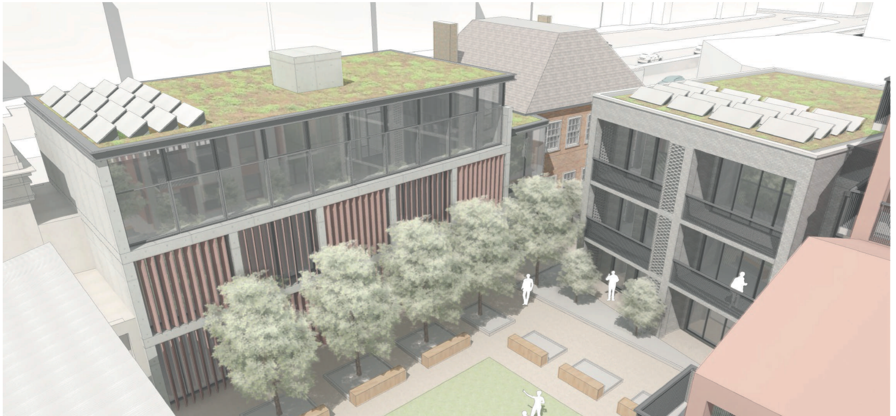
AERIAL VIEW INSIDE THE COURTYARD LOOKING TOWARDS THE COMMERCIAL BLOCK