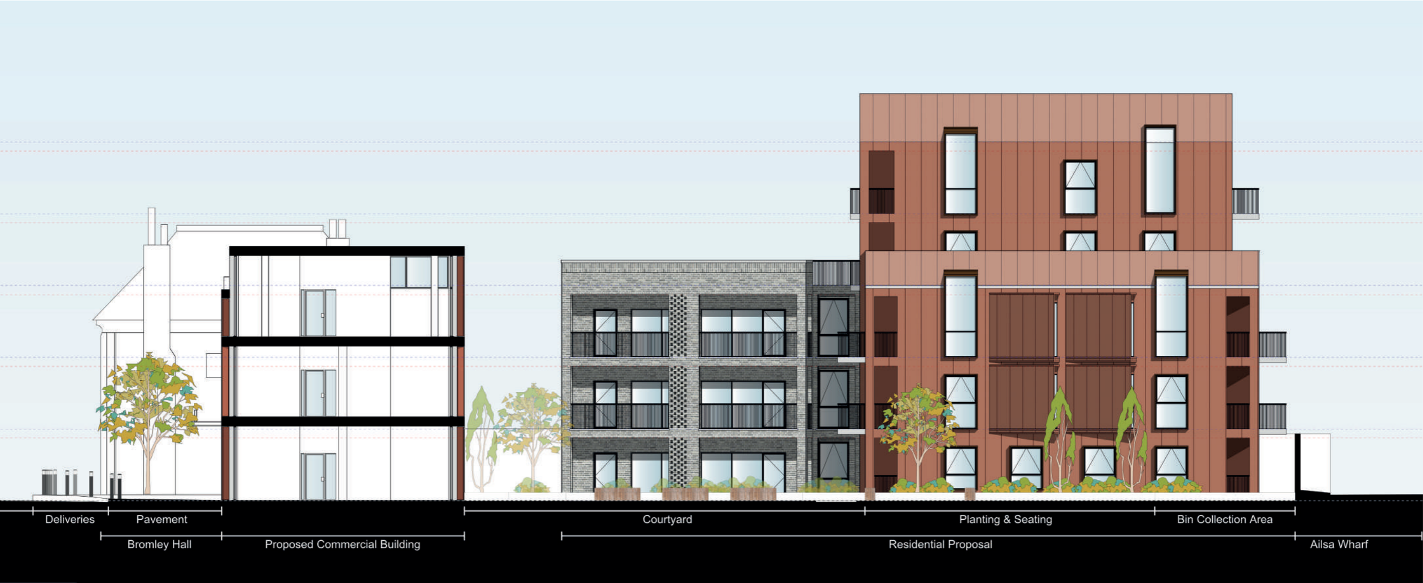
SOUTH ELEVATION (D-D)