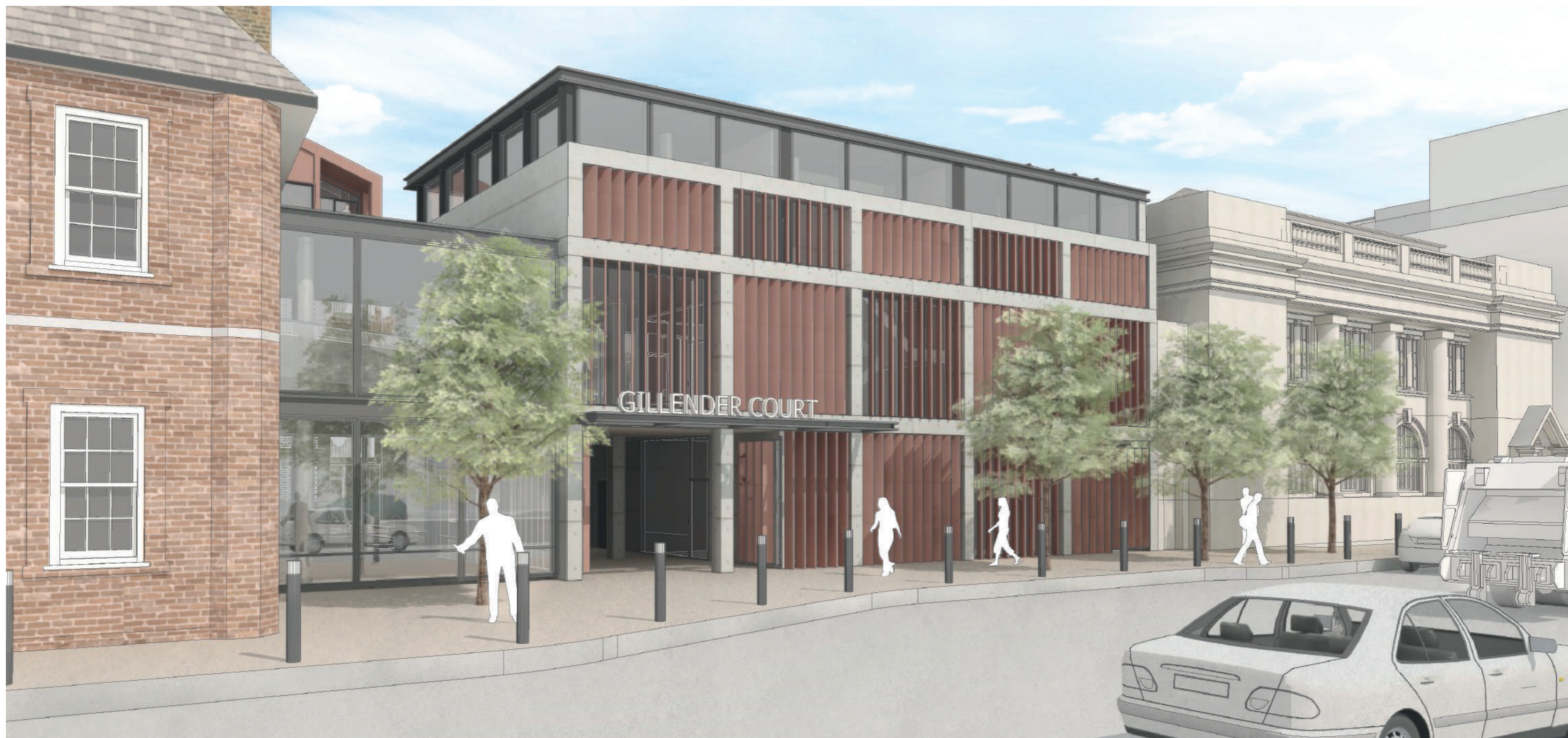
VISUAL OF THE STREETScape AND FACADE IN CONTEXT OF BROMLEY HALL AND POPLAR LIBRARY